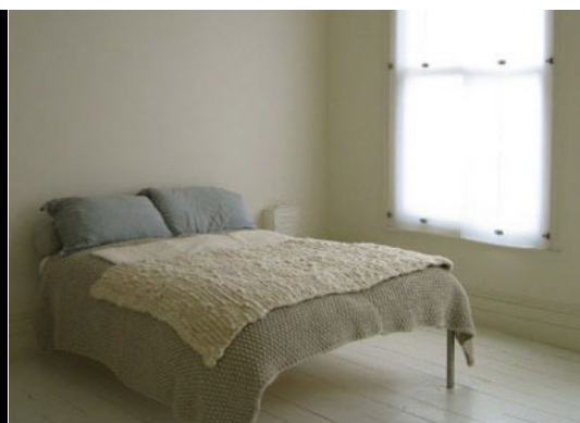
Used for int. and ext. shots